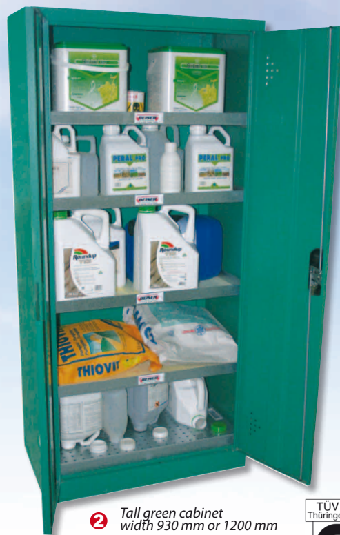
2 Tall green cabinet width 930 mm or 1200 mm