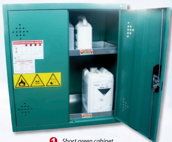
1 Short green cabinet