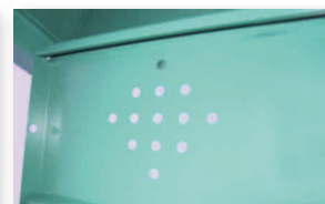
Top and bottom vents in the doors