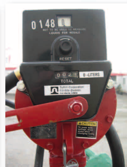
Manual pump with flowmeter