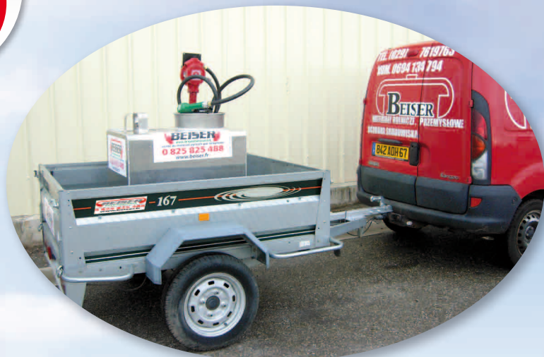
250 L MODEL WITH TRAILER

▶ Ideal for transporting petrol in a vehicle or on a trailer while ensuring compliance with standards