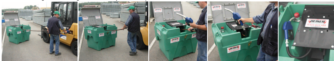
Easy access for all types of vehicles (tractors, reapers, etc.) at all locations thanks to the winding reel and its 8 m hose

Automatic winding reel: the tubing is wound directly around the protected coil