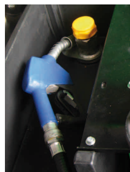
Gun support and vent

Automatic winding reel: the tubing is wound directly around the protected coil