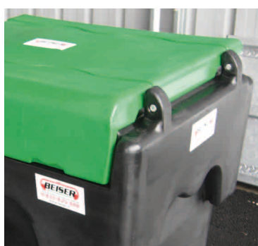
Possibility to attach transport support straps