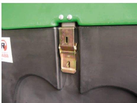
Padlock-compatible protective cover